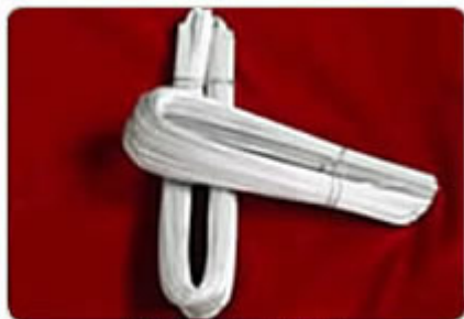
U Type Iron Wire

Anping Sunshine Metal Product Factory is specialized in manufacturing U tape wire. Our product wins a good reputation not only in China but also in many foreign countries.