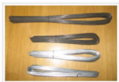
U Type Wire

Packing of U Type Iron Wire: According to our customers' requirements.