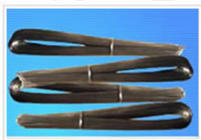
U Type Wire