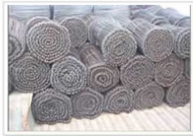
Loop Tie Wire