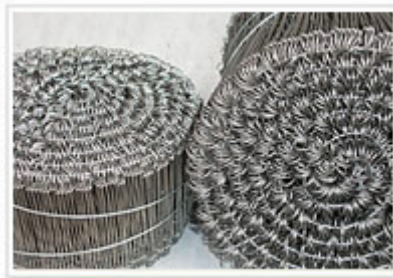
Loop Tie Wire