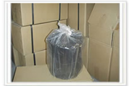
Loop Tie Wire