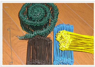
Loop Tie Wire

We can also supply rebar tie wire, baling tie wire, plastic coated wire ties and other binding wires.